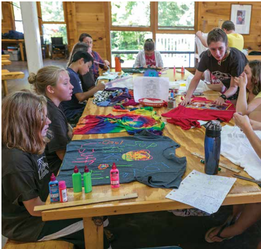
Clockwise from top left: T-shirt styling in the Dining Hall. A CAMP! fortune-teller. One of the many games at carnival.

Core: To offer a program of experiences and activities in art and music, natural science, physical activity, water safety, nutrition and hygiene, and literacy.