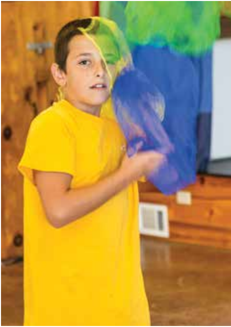
Juggling is just one of many skills campers can be introduced to.

“Camp is magic. Take a group of people and unite them with the goal of creating an environment where everyone is loved and accepted, where they truly enjoy each other’s company, and you can’t help but create magic. Where else can you make a difference in the life of a child?”