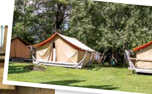
Clockwise from top left: Staff teach woodworking skills as campers help construct the week-ending carnival. Sturdy tents at Camp Farnsworth. Hair braiding. Fun with feathers. Making tie-dye shirts at the ever-popular art room. Camper lending a helping hand . . . or two!

For campers at Camp Exclamation Point, Inc. (CAMP!), the experience is life changing.